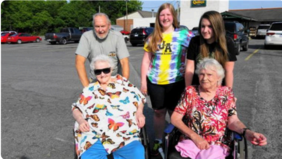
Fun night! Dinner out